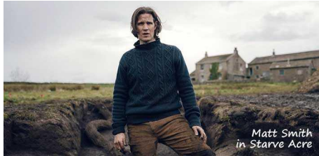
Matt Smith in Starve Acre